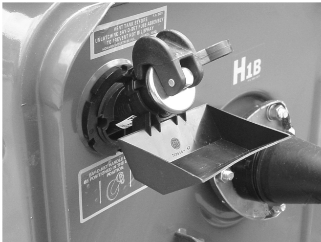
Figure 1: Drip Guard installed in a single-phase pad-mounted transformer.