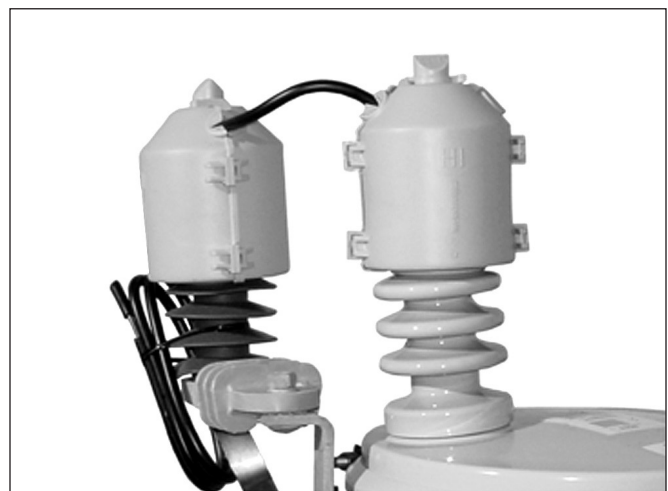
Figure 1: 2140 Wildlife Protectors installed on overhead distribution transformers.

To remove the protector, begin by opening one side first. Compress the latching tabs and pry the latches apart. It may be possible at this point to spring open and remove the protector with the other side still latched. If not, proceed to unlatch the opposite side to remove the protector.