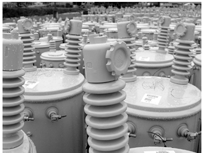
Figure 1: 2140 Wildlife Protectors installed on overhead distribution transformers.

To remove the protector, simply unlatch the protector body and unscrew the handwheel (if present).